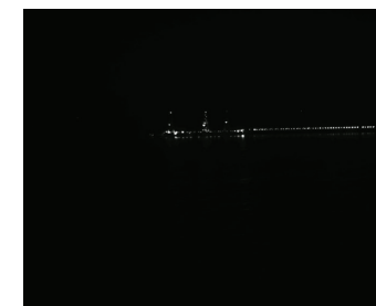
Low Light Imager